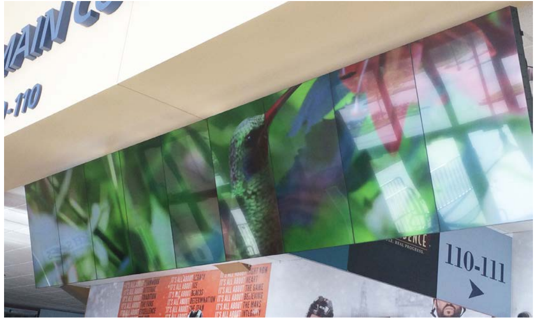
Silverstein Arena, Kansas City, Missouri, USA

Userful Corporation is a leading centralized display software company that makes it simple and affordable for organizations to implement and centrally manage video walls, virtual desktops and beyond with exceptional performance. Userful is the trusted provider of over 1 million centralized displays in over 100 countries.