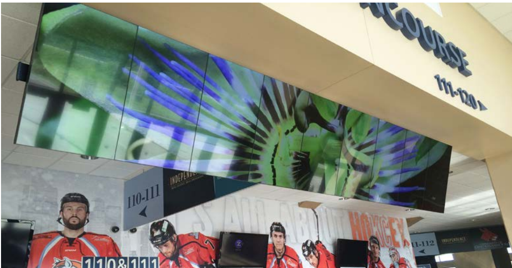
Banner video wall in the Silverstein Arena

As part of the emphasis on digital fan engagement, the arena decided to deploy a "banner video wall", consisting of nine (9) displays in a portrait configuration. To implement the project, the arena engaged Keywest Technology, an industry leading AV service provider with 15 years of experience helping businesses implement digital signage across the United States. Traditionally, Keywest has used a multi-headed video card solution to deploy video walls, but Silverstein Arena's plan went beyond the capabilities of Key West's current solutions. The arena wanted a flexible video wall able to use large numbers of portrait displays but also able to integrate their cloud CMS application, Breeze2.0. They needed a more flexible solution that didn't put the project budget at risk.